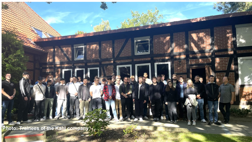
Photo: Trainees of the Kahl company