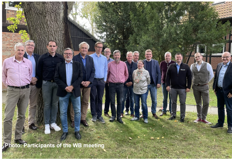
Photo: Participants of the WB meeting

Topics included ongoing projects, those in the application phase and newly proposed project ideas up for discussion.