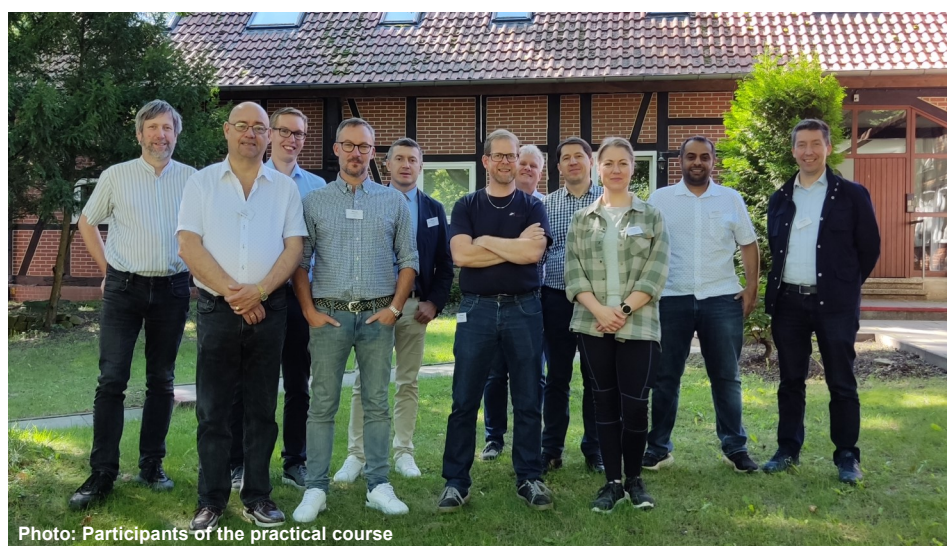
Photo: Participants of the practical course